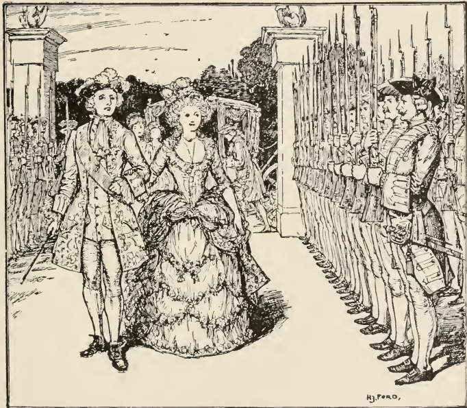
THE SWISS GUARD PRESENT ARMS TO MARIE ANTOINETTE

and glad to spend a few quiet hours with her dog and her lady-in-waiting. Still, just now she was not allowed much time to feel lonely, for she seemed always dressing and undressing to go to some brilliant festivity. One evening a great ball was given, at which even madame Clotilde was allowed to appear, and a young princess of Lorraine, Marie Antoinette's cousin, was present. For